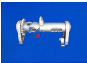
Heavy Duty Truck Webbing Winch