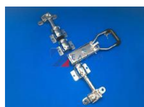
Stainless Steel Polished Door Locking Gear