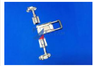
Body Lock For Dump Truck Door