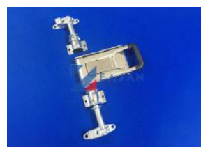
22mm Trailer Assembly Truck Door Handle Lock Set