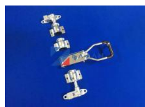
Steel Zinc Plated Trailer Door Locking Gear