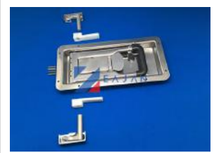
Trailer Recessed Door Lock