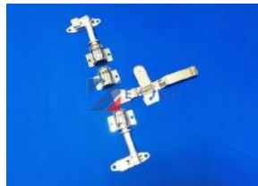
Refrigerator Cargo Food Door Locking Gear