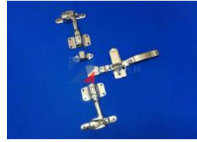
Semi Truck Body Parts Trailer Latch