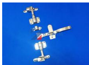
Manufacturer Of Truck Body Parts Truck Lock