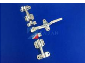
Shipping Container Truck Rear Door Lock