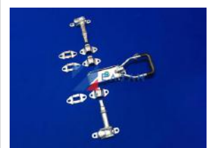
Steel Cam-Action Lockable Rear Door Lock