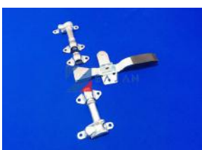
Truck Body Parts Trailer Lock