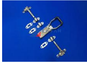
Heavy Duty Welded Truck Rear Door Lock