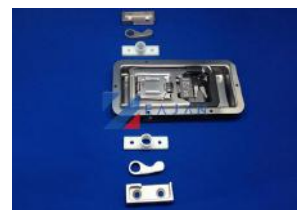
Dry Freight Trailer Recessed Door Lock