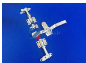
Casting Steel Parts Trailer Truck Rear Door Lock