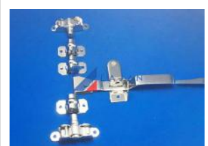
Stainless Steel Heavy Duty Refrigerated Door Lock