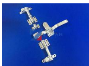
Truck Body Fittings Trailer Latch