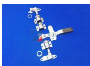
OEM Truck Container Truck Door Lock