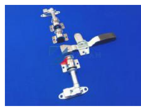
Trailer Door Locking Gear