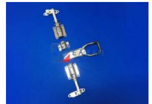
OD27mm Stainless Steel Trailer Door Lock