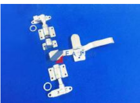
Truck Rear Door Lock