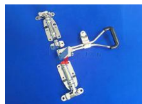
Food Truck Refrigerator Freeze Container Door Lock