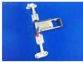
Body Container Rear Sliding Door Lock