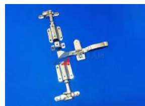
Hot-Selling And High Quality Truck Door Lock