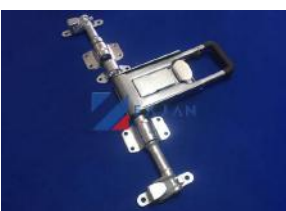
Container Truck Van Door Lock