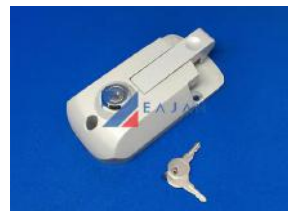
Zinc Alloy Truck Door Handle Lock