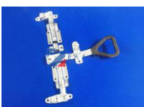
Steel Cam Door Lock