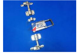
Sample Accepted Van Door Lock