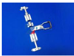
Van Box Trailer Door Lock