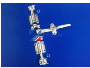
China Shipping Container Door Lock