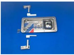
Stainless Steel Polished Recessed Door Lock