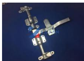
Galvanized Steel Side Board Trailer Locks