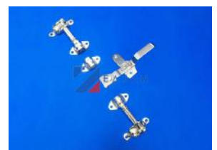
Food Truck Refrigerator Freeze Trailer Lock