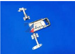
China Truck Body Door Lock