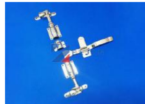
Mild Steel Or Stainless Steel Polished Door Lock